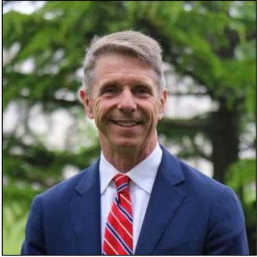
Rob Wittman (R-Incumbent)

Rob Wittman is pro-life. He opposes abortion on demand, and he supports protection for unborn children.